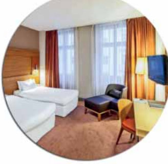
Price: 2X room/night with breakfast 1000,-CZK ≈37 EURO (500,-CZK/person)