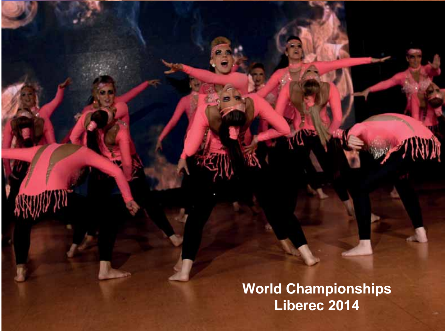
World Championships Liberec 2014