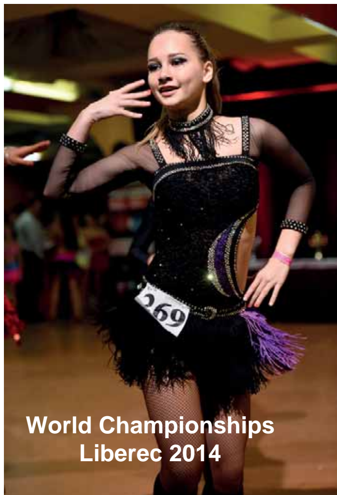
World Championships Liberec 2014