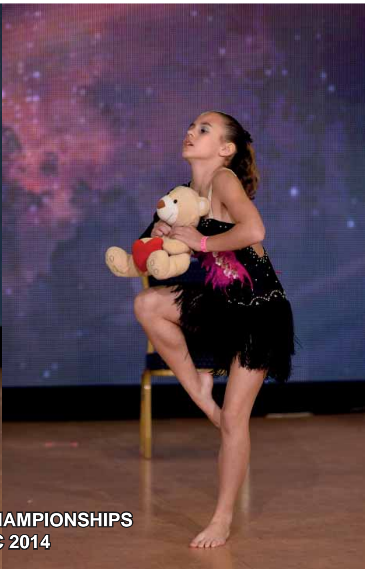
WADF WORLD CHAMPIONSHIPS LIBEREC 2014