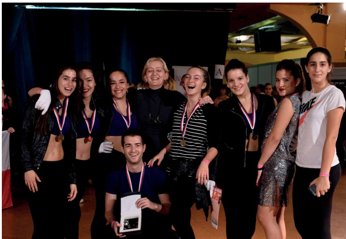
Team Monte Negro

We are happy to be able to support these three events which have all been running for several years and we know they are all well organised events. Good luck to all three!