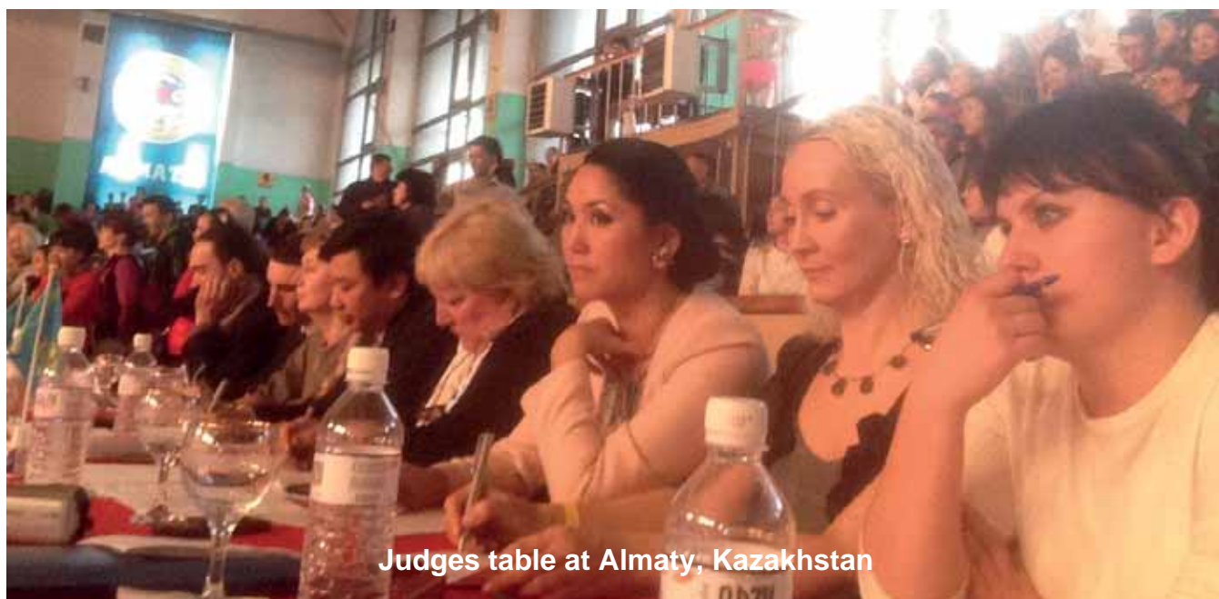
Judges table at Almaty, Kazakhstan